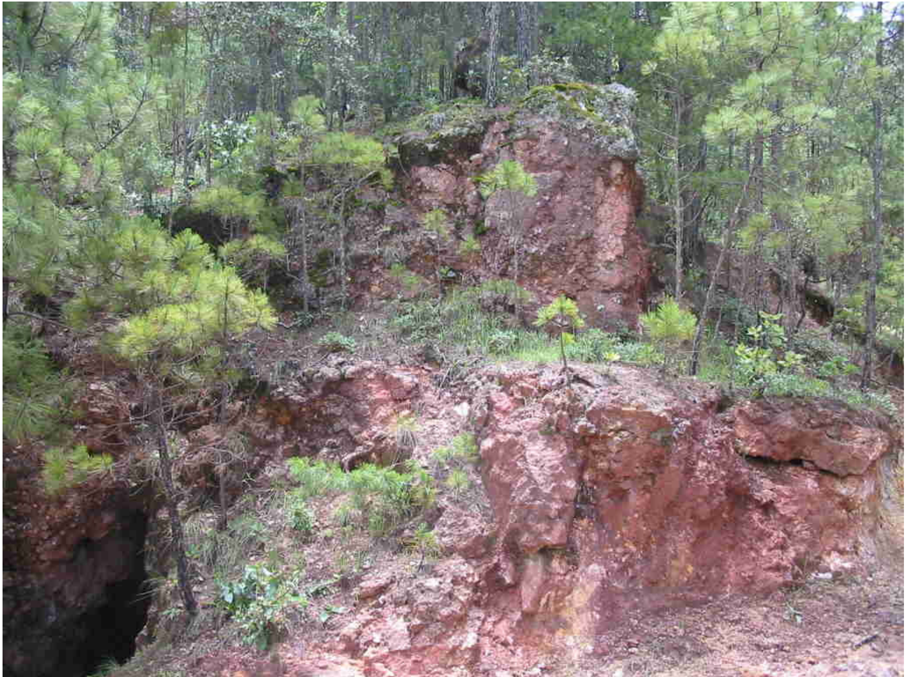
Primary argillic alteration on the road down to Desmontada-Mala Noche