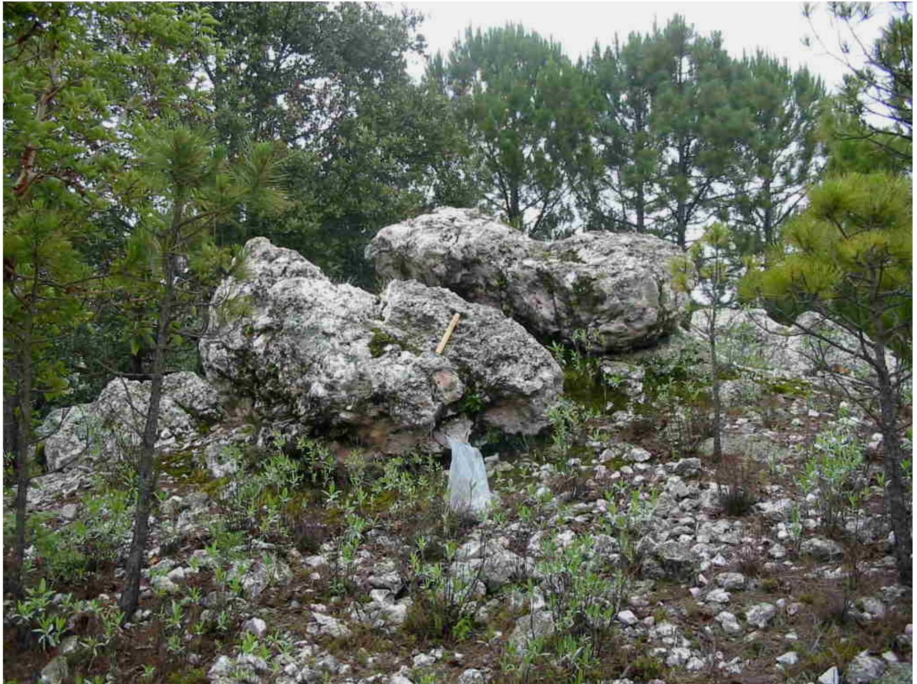
Outcropping vein structure, over 20m wide