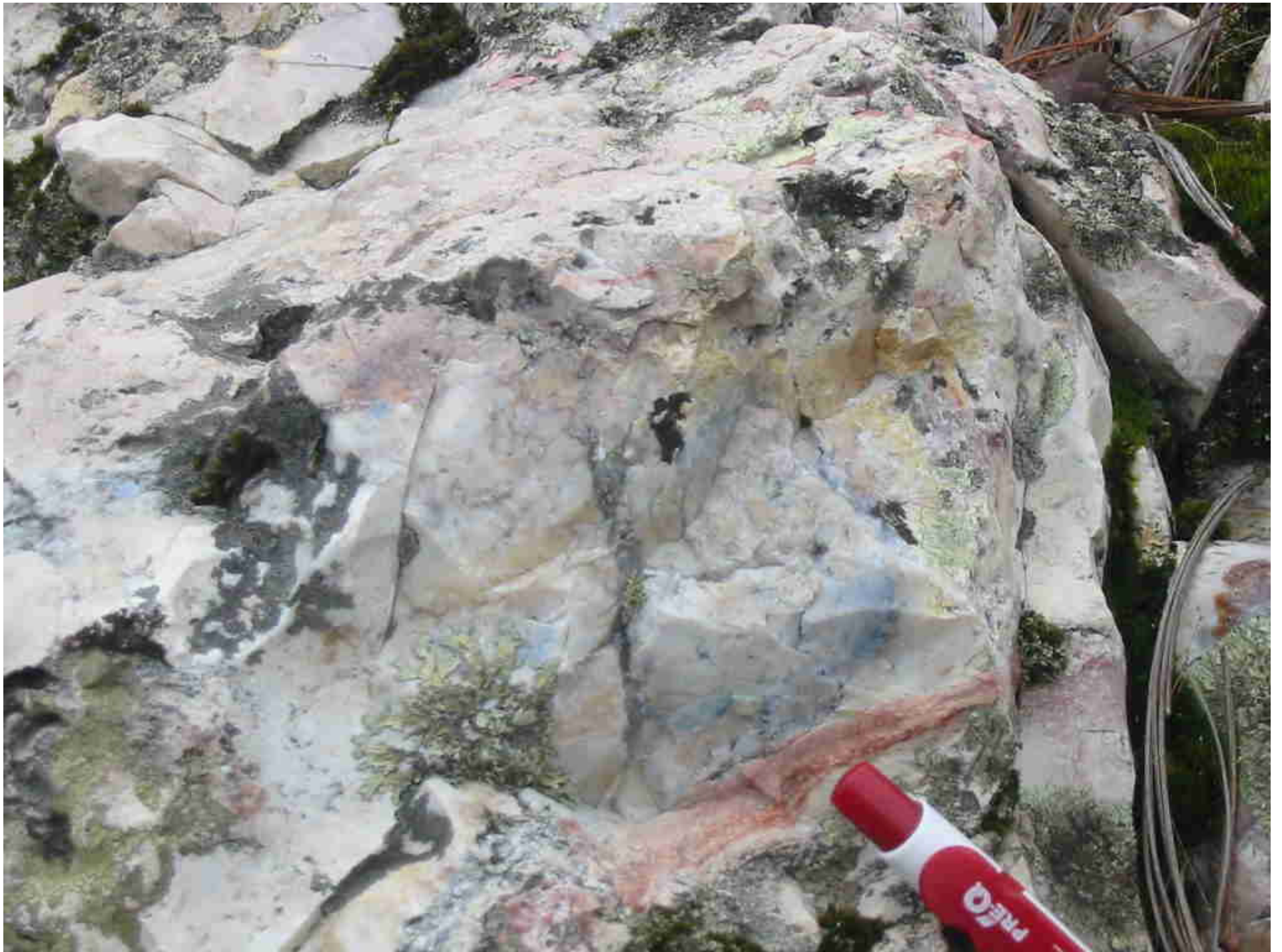
Close-up view of the silica outcrop