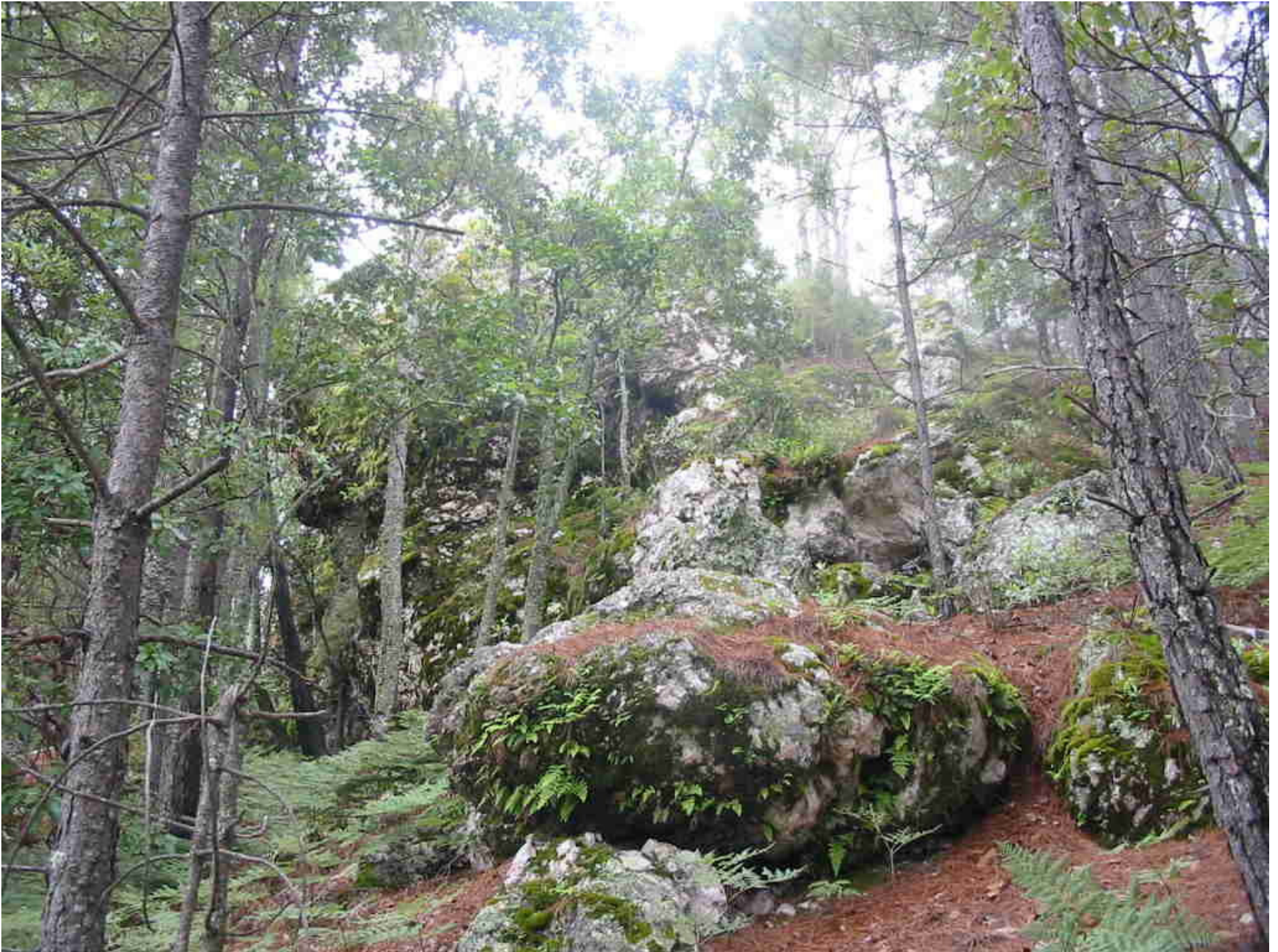
View of the outcropping vein, structure width reaches 25m