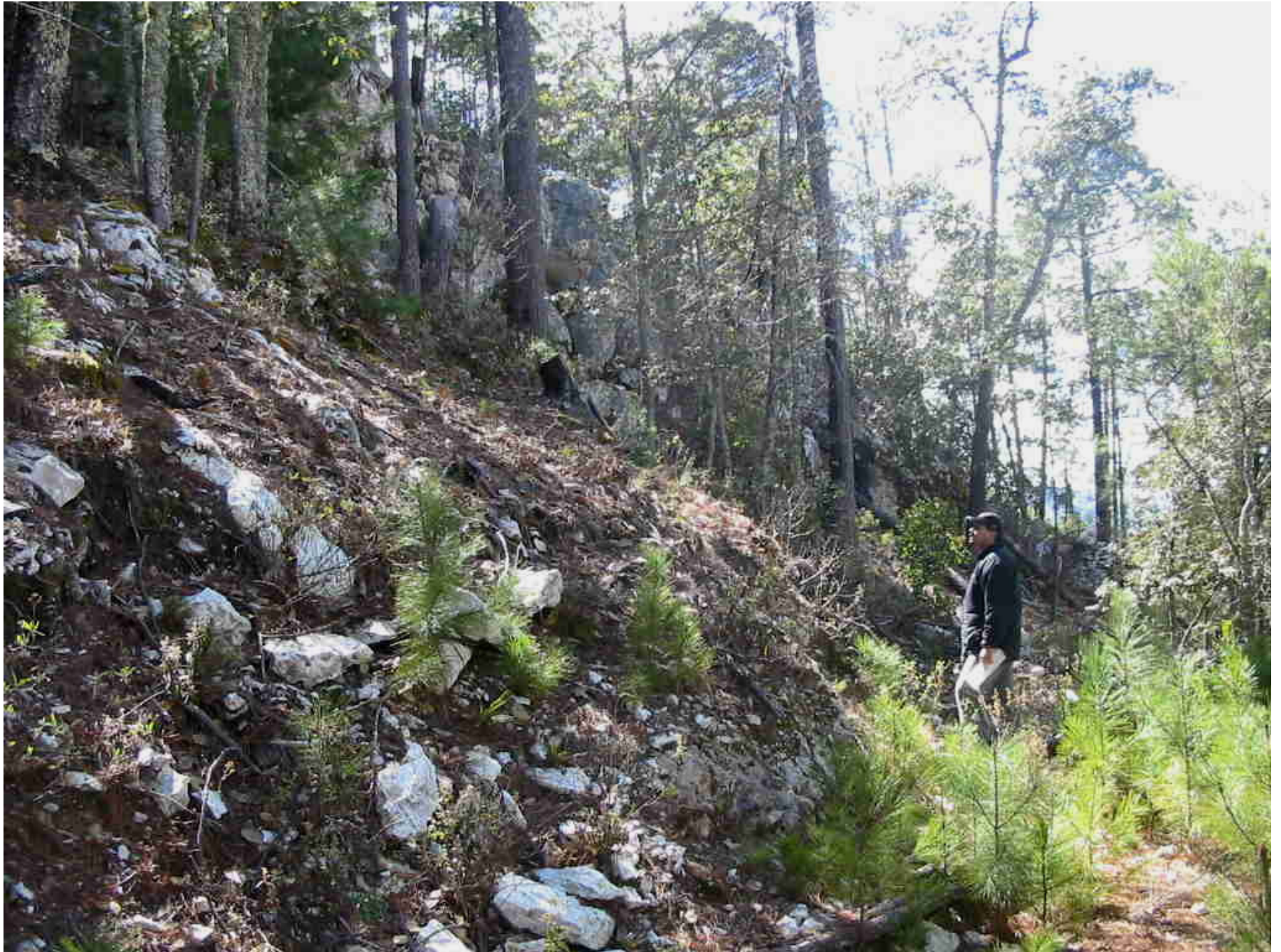
The structure, with large white quartz boulders, continues towards the east, at this point over 25m wide