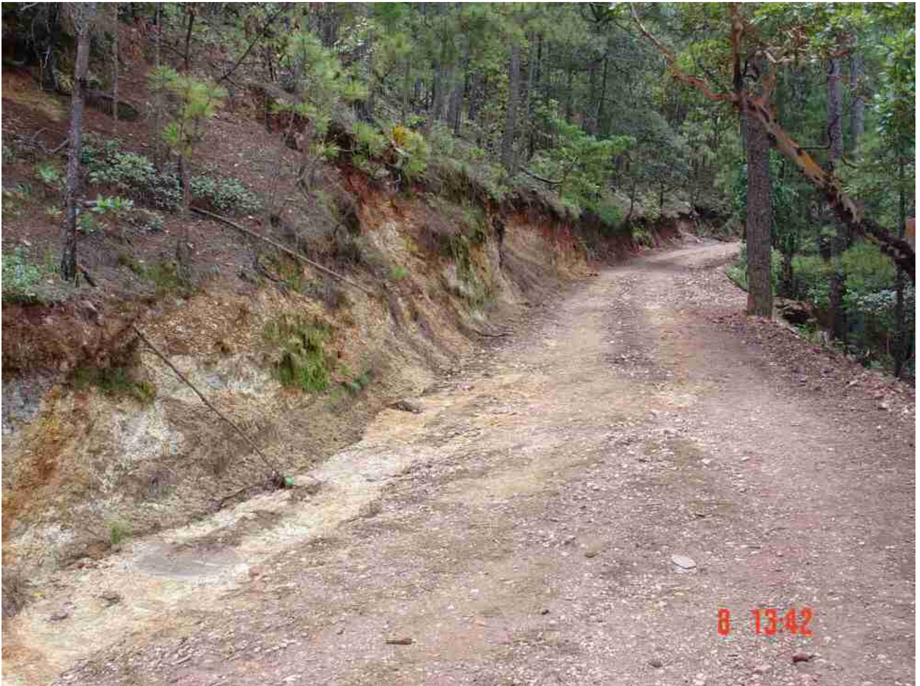
The alteration zone area covers over 150 metres along the road to Desmontada