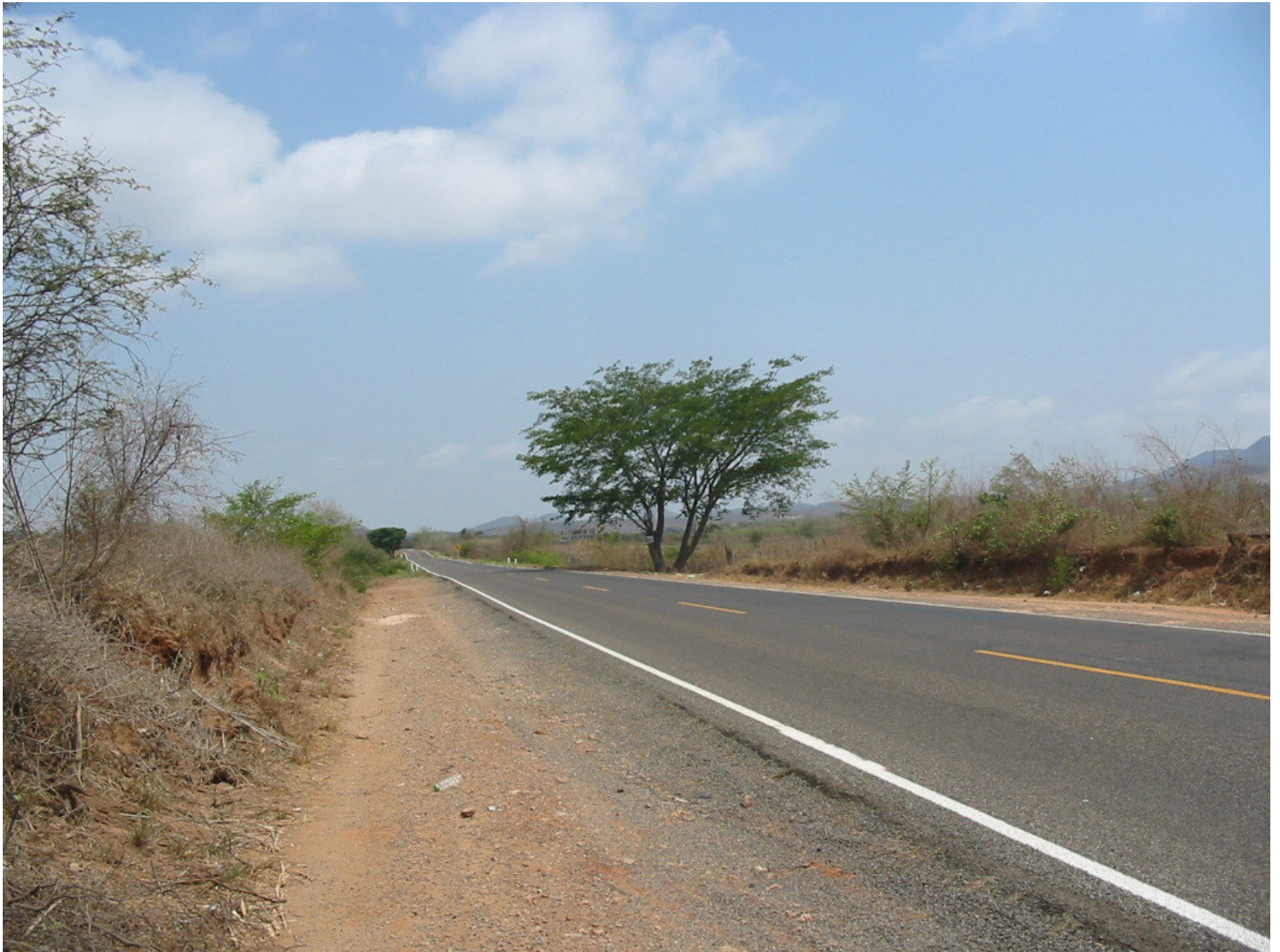
El Rosario Mazatlan highway passes through project area