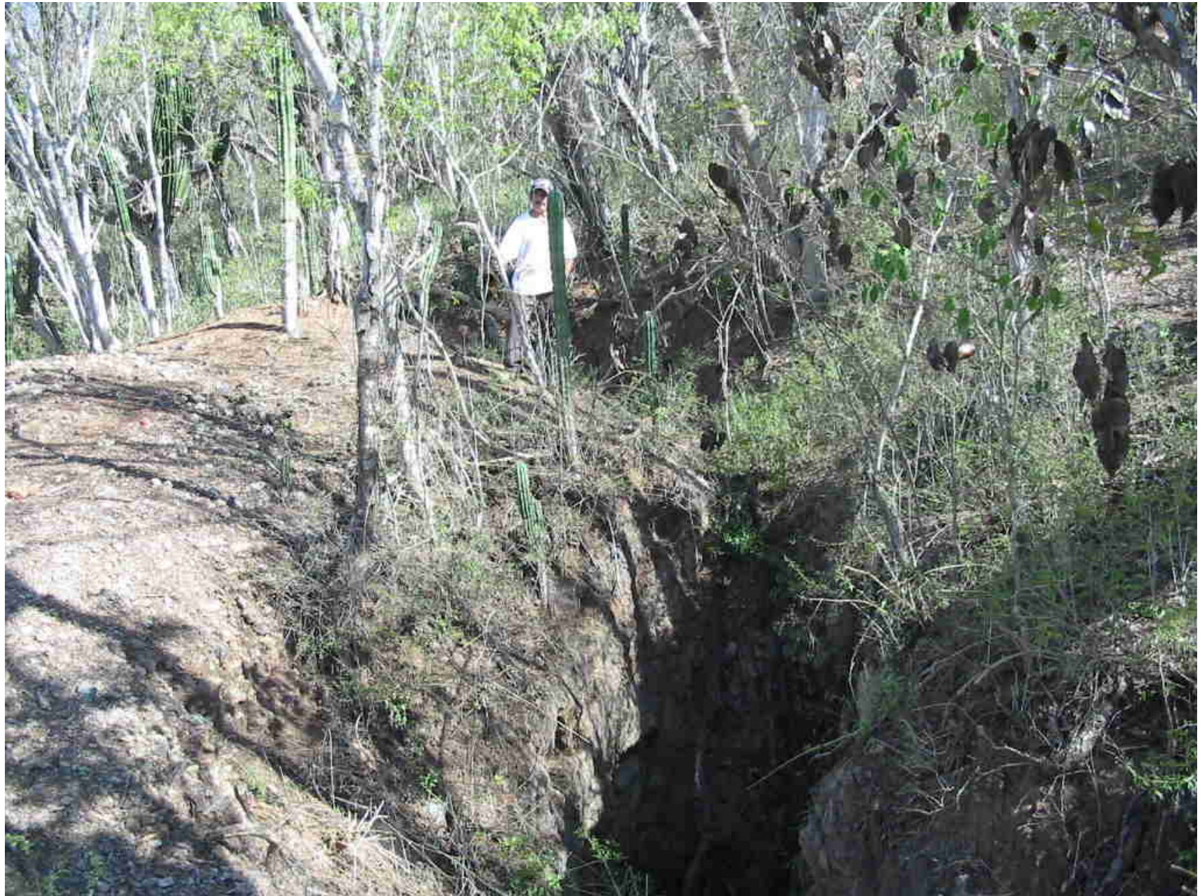
Pits over the Gris vein. Vein sample assayed 46 g/t Ag, and 4.49% Cu over 1.5m.