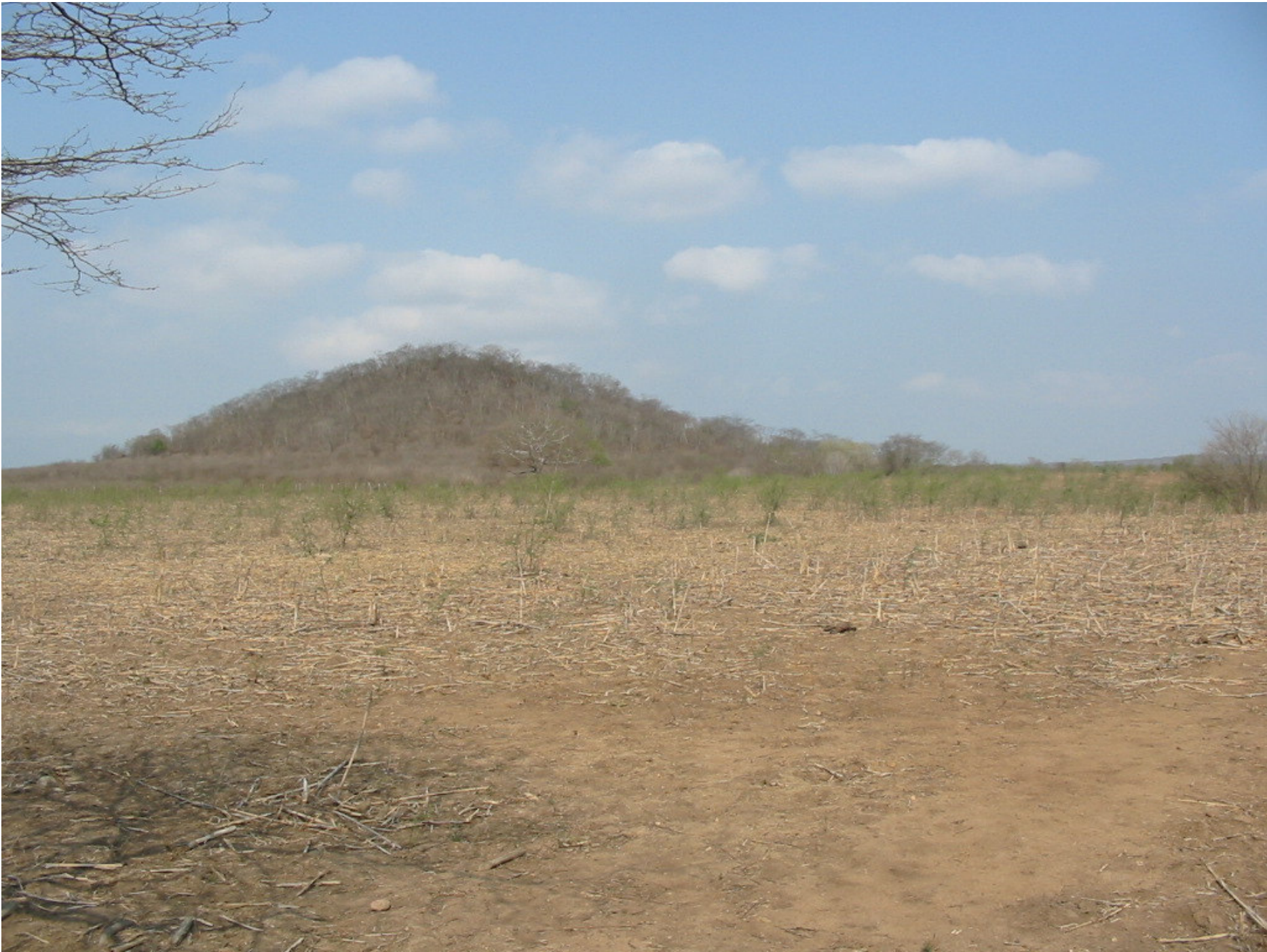
Intrusive formations in the coastal plain