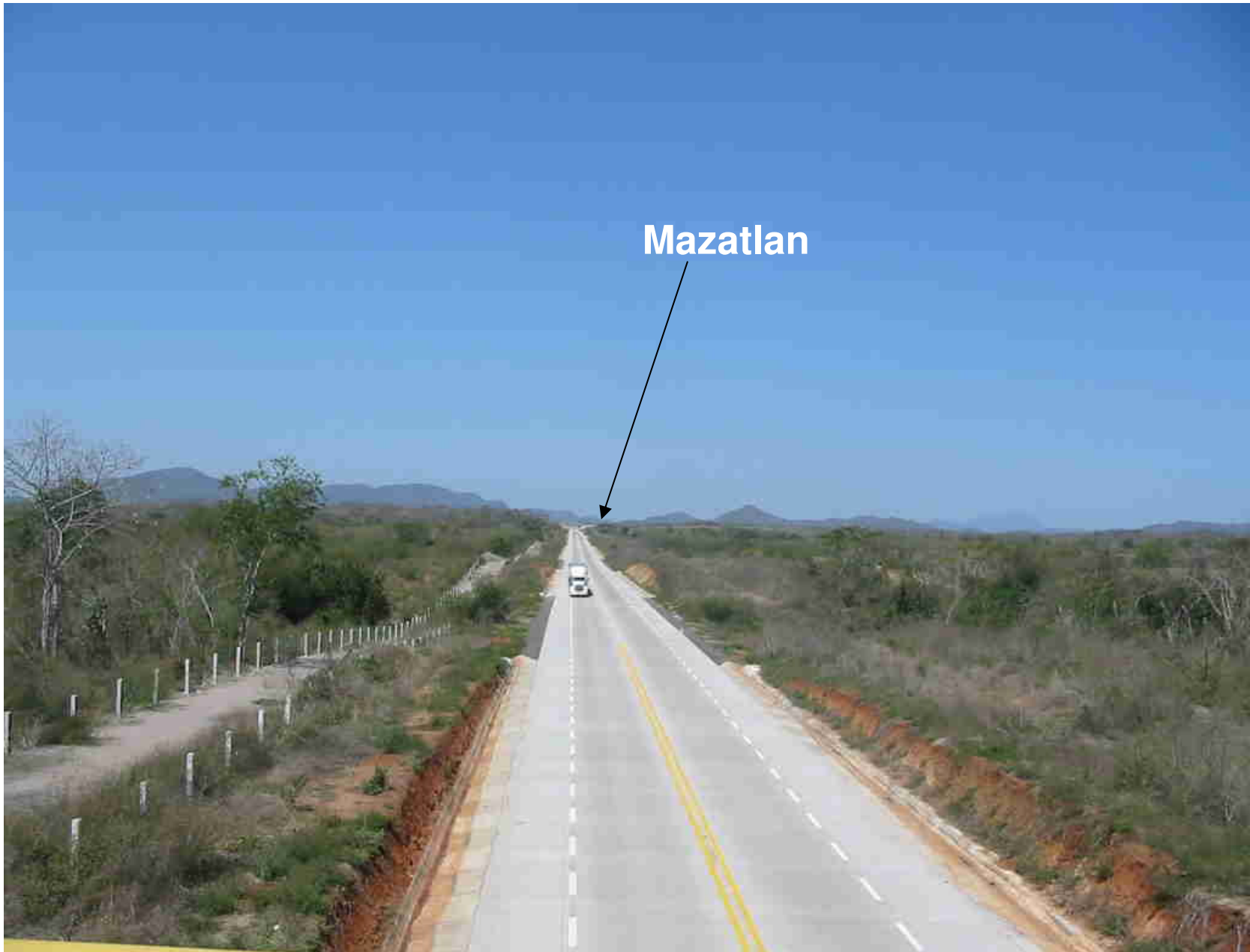
The new Mazatlán-Escuinapa highway crosses the western part of the Property. Mazatlan is located 50km to the northwest.