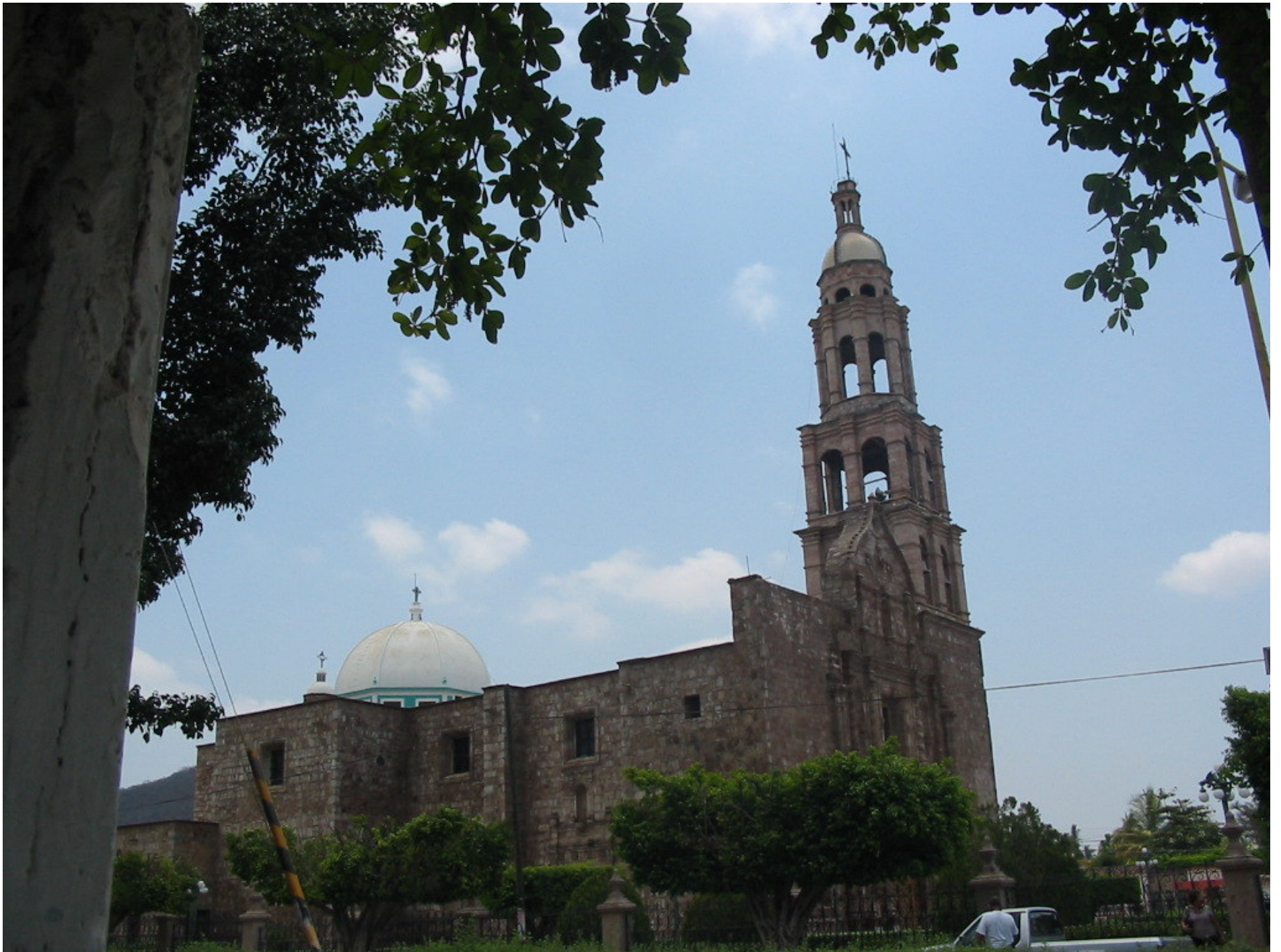
Historic El Rosario Gold Mining Town