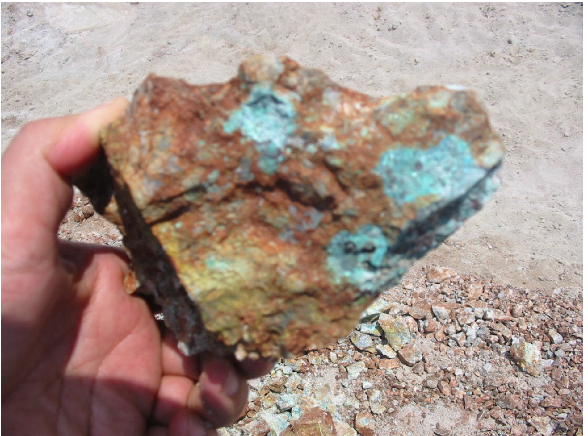
Copper stained exposed rocks