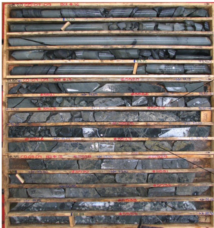
HOLE CO-07-09, LINDA VEIN