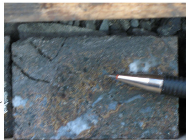
light brown sphalerite